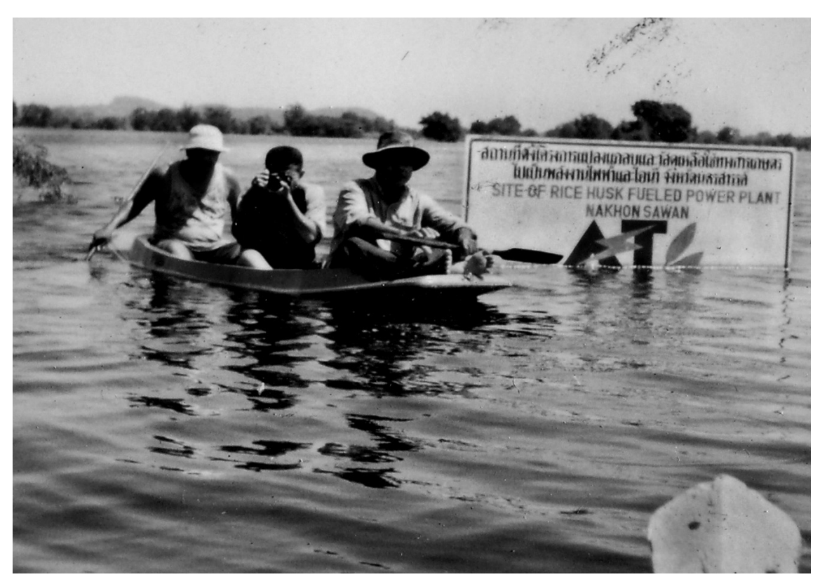
Site of proposed A.T. Biopower plant near Nam Song during the seasonal floods.

The developers used several tactics that are common in such situations in their attempts to stop the protests. Members of a community in the nearby Pichit province, who were also facing the possibility of a new biomass power station, were sent by the company to bribe the village leaders, offering them compensation to stop protesting. All of the village leaders were told by developers and local government they could be in danger if they continued the campaign. Various threats were made, large bribes were offered, and the villagers were repeatedly lied to in attempts to destroy their unity.