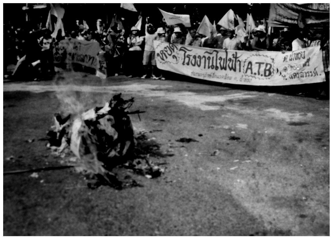
Banner reads, 'Stop the Electricity Plant A.T.B'.

This incident provoked the villagers to send a grievance letter to the local government. Initially, they were divided over whether the power station should be built, which caused strife in daily life as well as between family members. Eventually, they resolved to end their divisions. The entire community of Nam Song agreed to sign the letter stating their objections to the meeting and to the proposed station. The villagers then created the Nam Song Conservation Club to co-ordinate a full-scale campaign against the project.