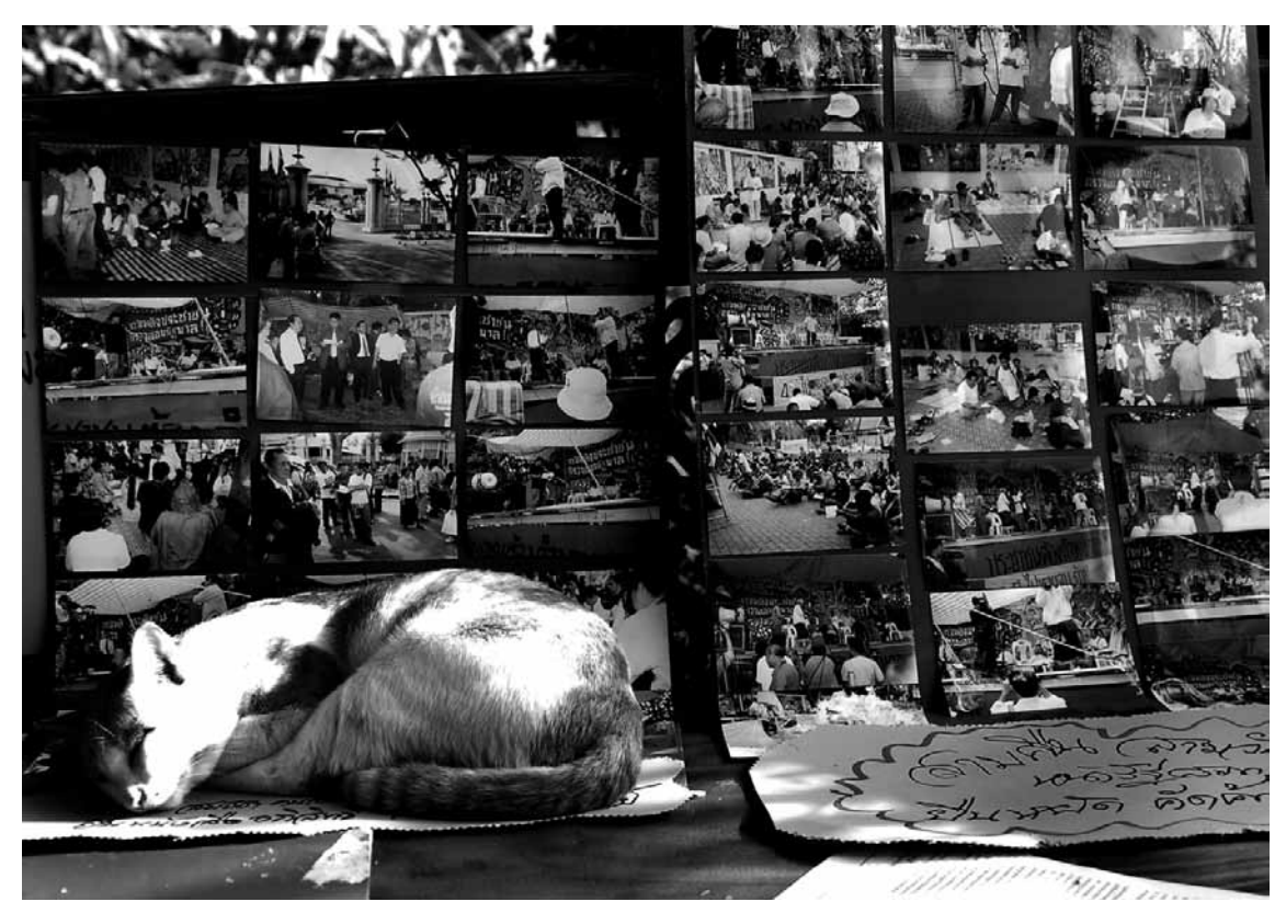
The Nam Song Conservation Club kept very good records of its campaign, including photos and notes from meetings.

And while for the moment Nam Song residents are protected from developers they still fear that other power plants will try to build on this particular site. The Nam Song Conservation Club remains committed to protecting their community from development projects because they are aware they may need to build another campaign at any moment.