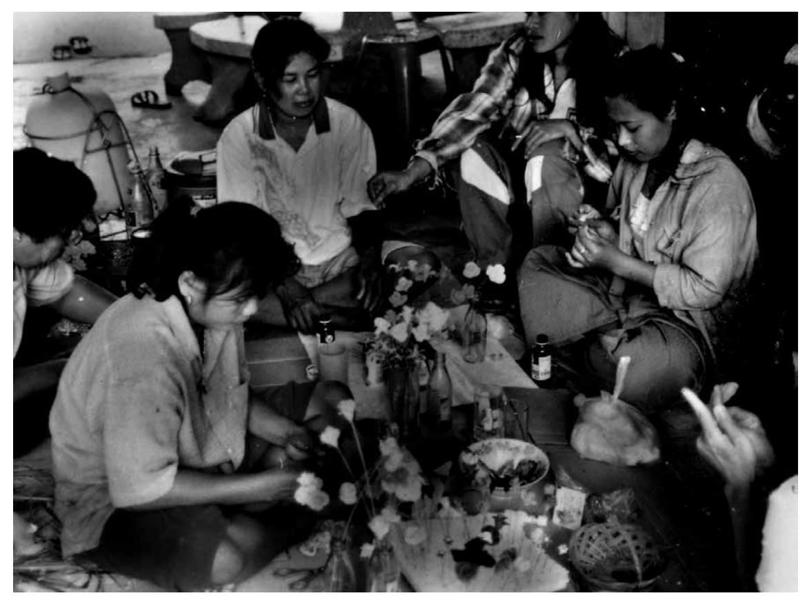
Women from Nam Song creating handicrafts for fundraising for the campaign.

The women in the village played an essential role in fundraising, organizing and maintaining trust within the community. The women made handicrafts and sweets to fundraise for the campaign. They sold t-shirts and sweets at meetings, which provided an opportunity to talk with others about the struggle and build trust. They canvassed an area of 10 km<sup>2</sup> and gathered 4,000 signatures for one of the rallies at the government headquarters.