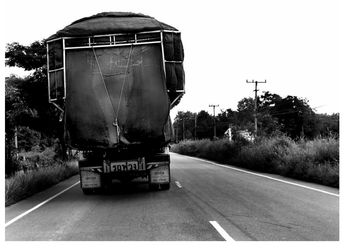
A truck piled with bags of rice husks on its way to the Pichit power station.

Local farmers in the region commented that they will have to replace this natural fertilizer with chemical fertilizers now because demand from the power plant has driven up the price of rice husks, meaning they are no longer affordable.<sup>4</sup> Local chicken farms and brick factories have to go further away to source rice husks, destroying a once self-sufficient system.