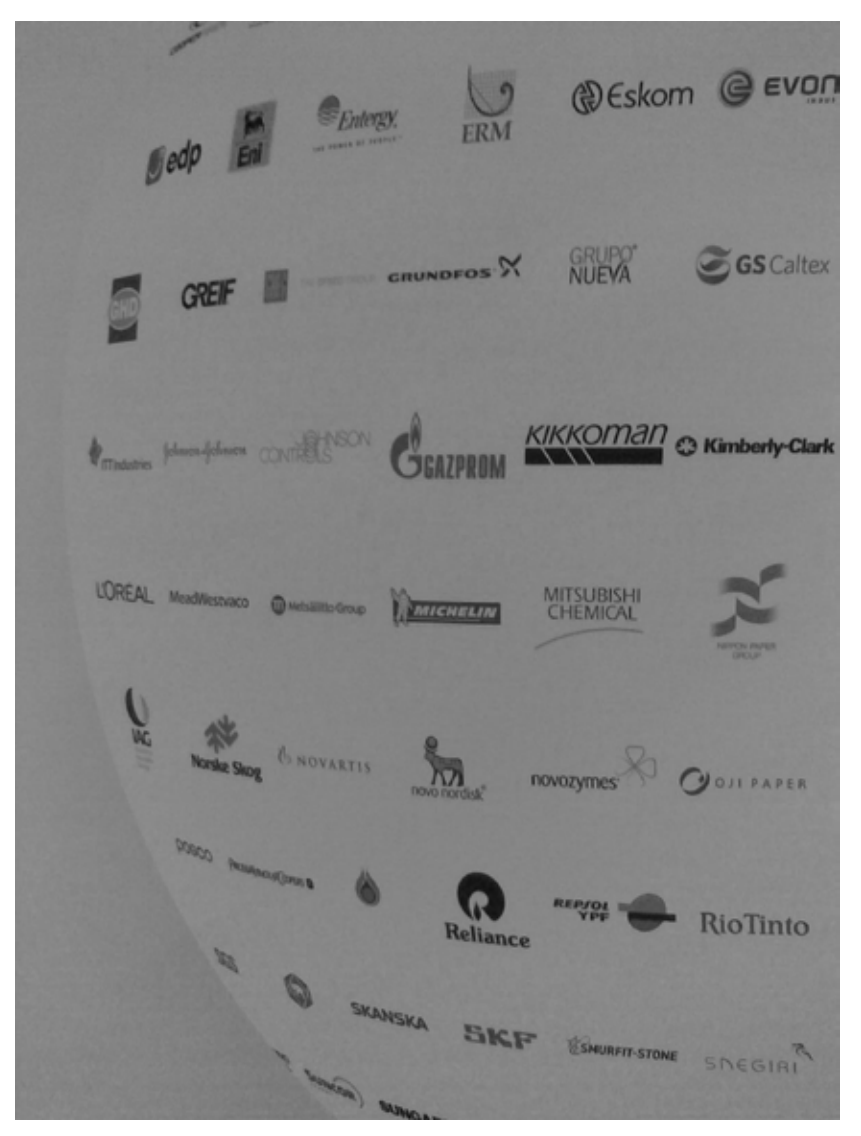
Figure 1: The world according to the World Business Council for Sustainable Development: a smooth earth populated by corporate logos. From the WBCSD display at the 2008 World Conservation Congress of the International Union for the Conservation of Nature.

WBCSD stand at the 2008 World Conservation Congress, is suggestive of its planetary reach and ambition. It depicts the brand logos of many of the world's largest multinationals, stretching across an abstract earth, smoothed of difference, diversity and inequality. This is a world good for capital. But is it also good for cultural and ecological diversity?